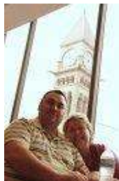
Inside The Bay Shopping Mall