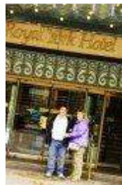
The Royal Park Hotel