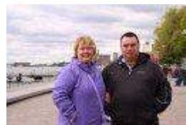
At the Toronto Lakes