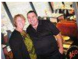
Restaurant at CN Tower