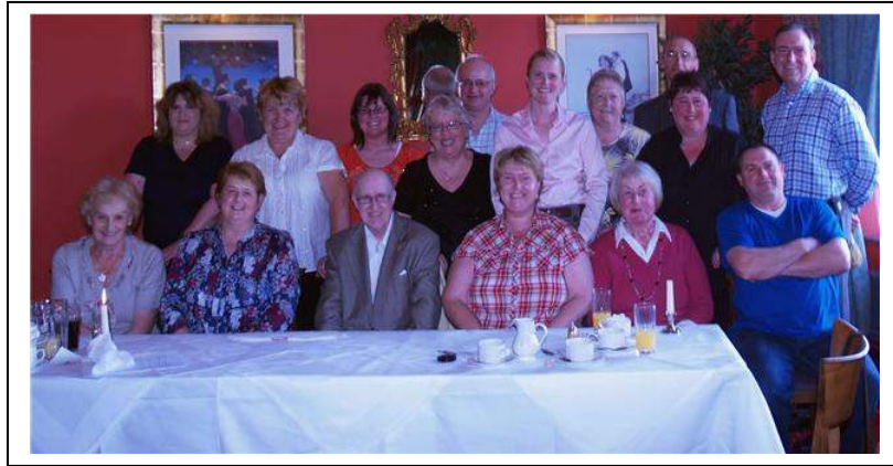
Here are the Group at the end of lunch